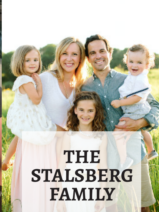
THE STALSBERG FAMILY